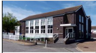
The Broadway United Church The Broadway, Lindfield Road, Eastbourne, BN22 0AS www.broadwayunitedchurch.co.uk