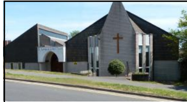
St Barnabas United Church and Christian Centre Kingfisher Drive, Eastbourne